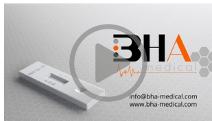
The Triple Antibody Test

Find out more about the Triple Antibody Test, how it can be used to protect your population and how we can further support with practitioner training.